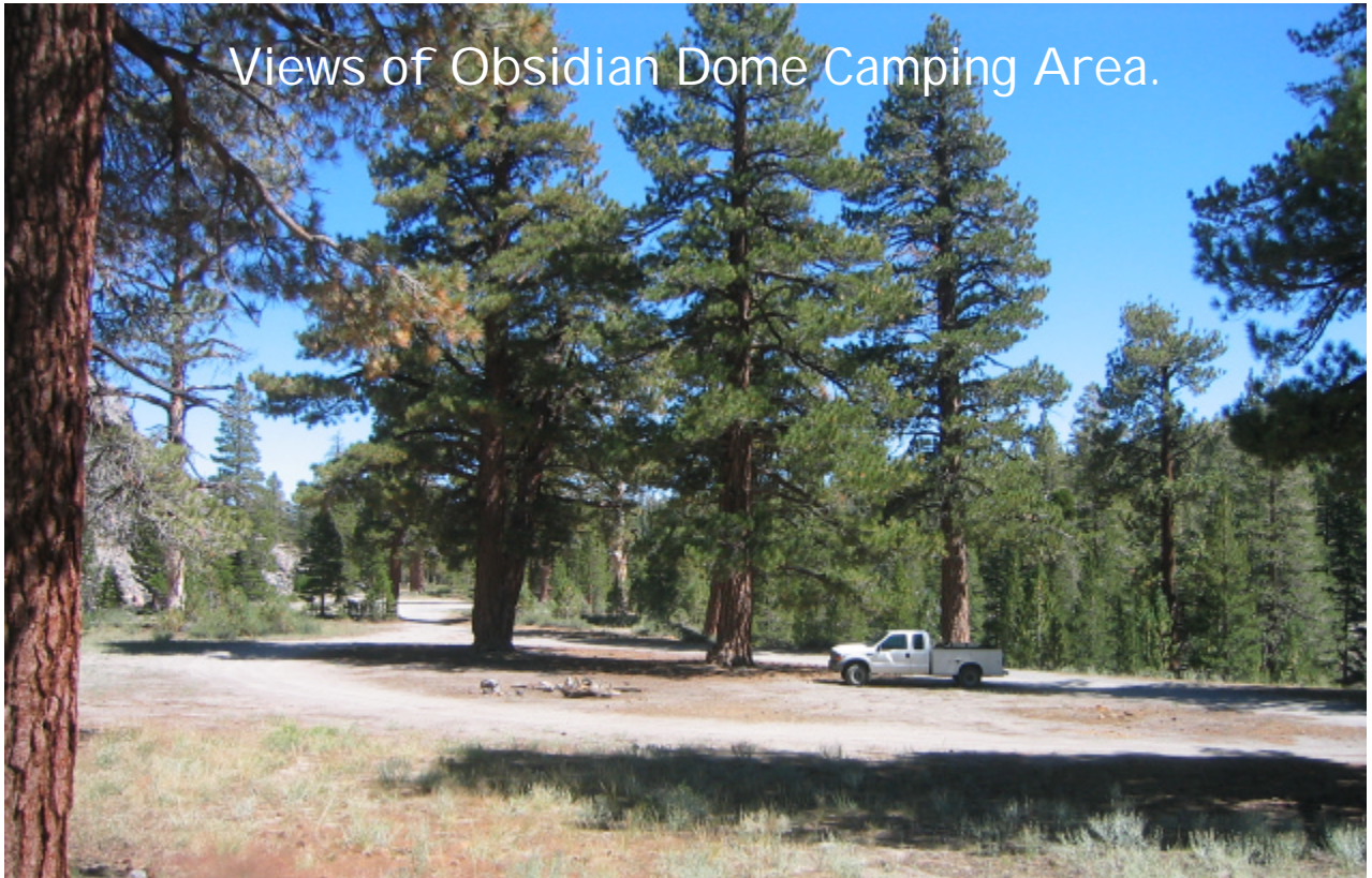
Views of Obsidian Dome Camping Area.