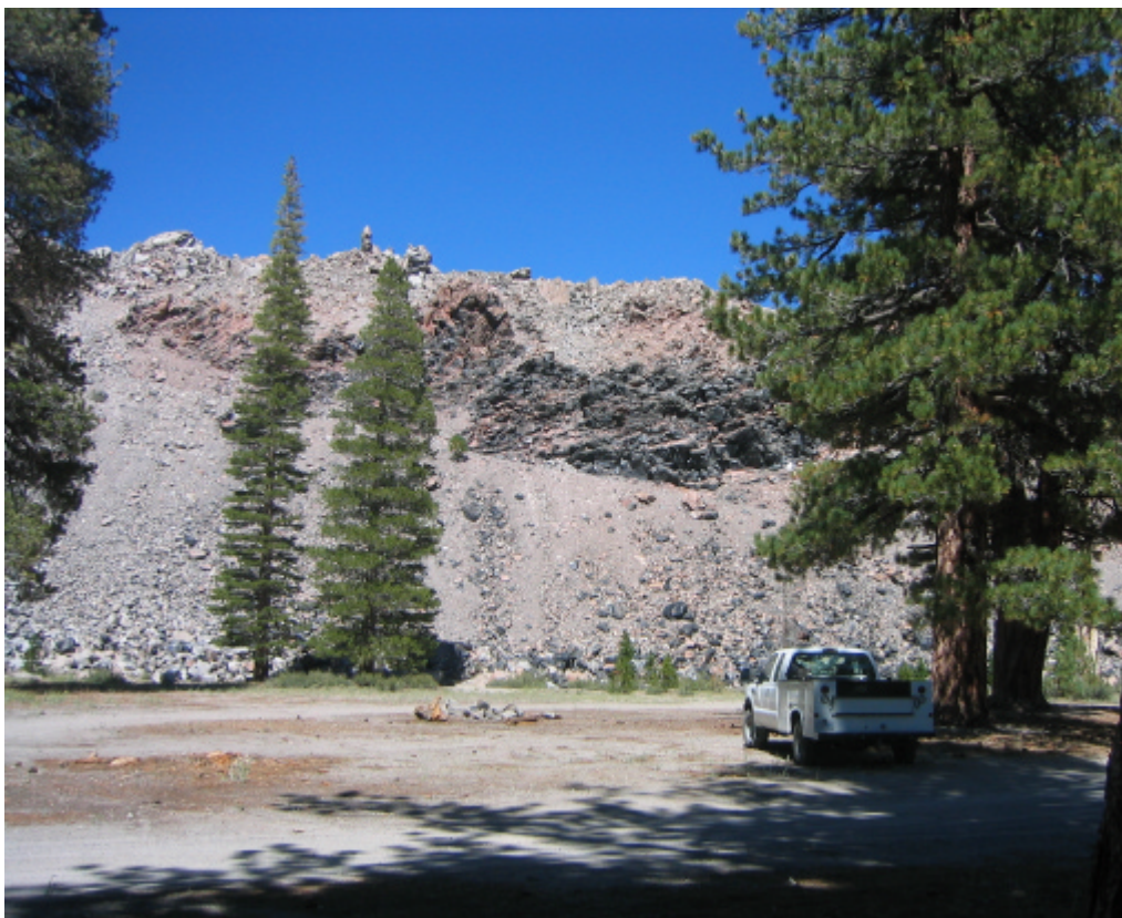
Obsidian Dome Camping Area with the dome in the background

Mono Lake - South Tufa, Mono Basin Visitors Center near Lee Vining, Panum Crater, Mono Craters, Black Point Fissures, canoeing, 20 minutes driving time