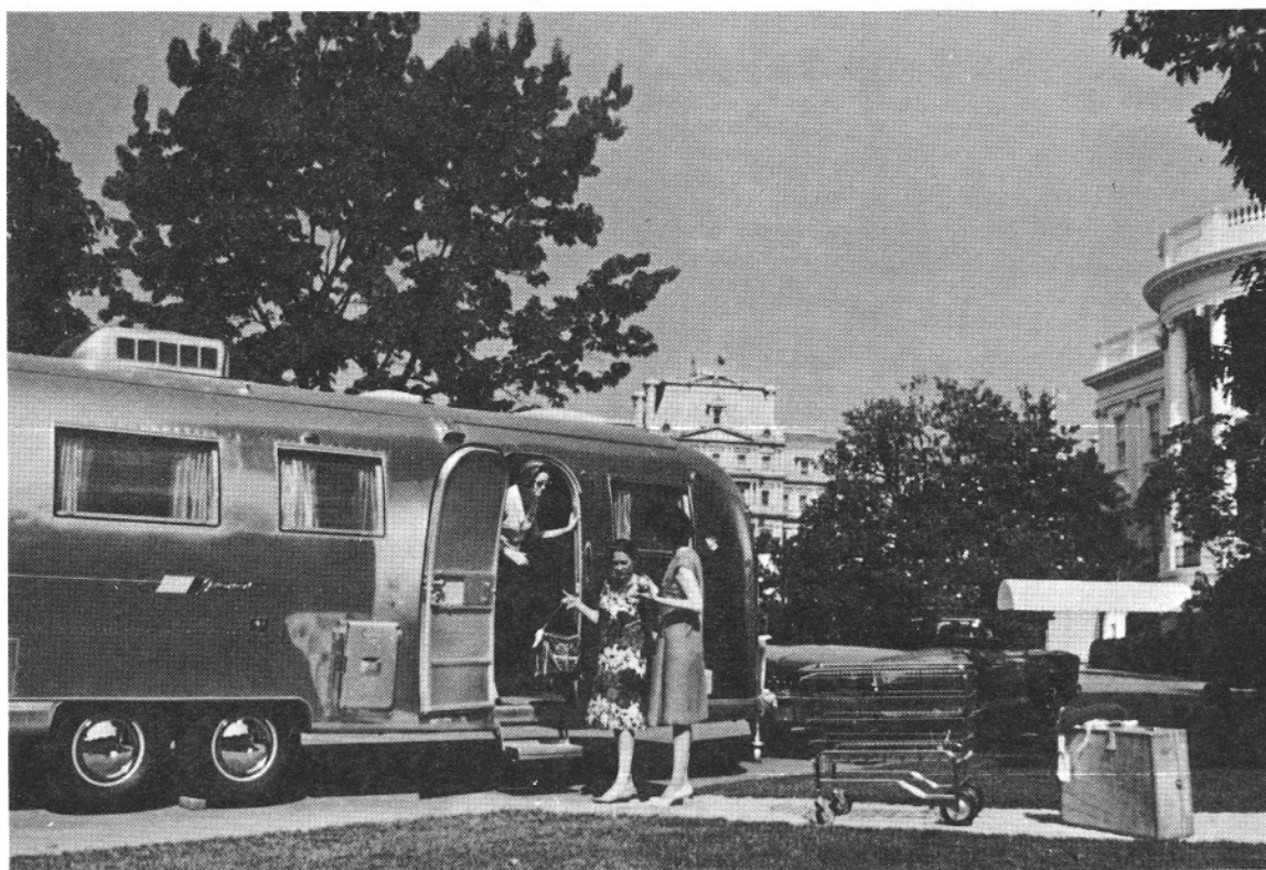
Lynda Bird Johnson Loads Airstream on White House Lawn (See story on Page 2)

A variety of contests have been planned: the photo contest offers prizes for several categories: native life, nature scenes, points of interest, and the best South of the Border slide showing an Air-