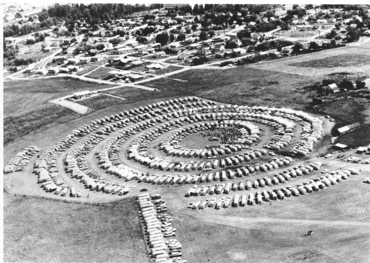
Vernon, B.C., 1962. The Caravanners will return this year.