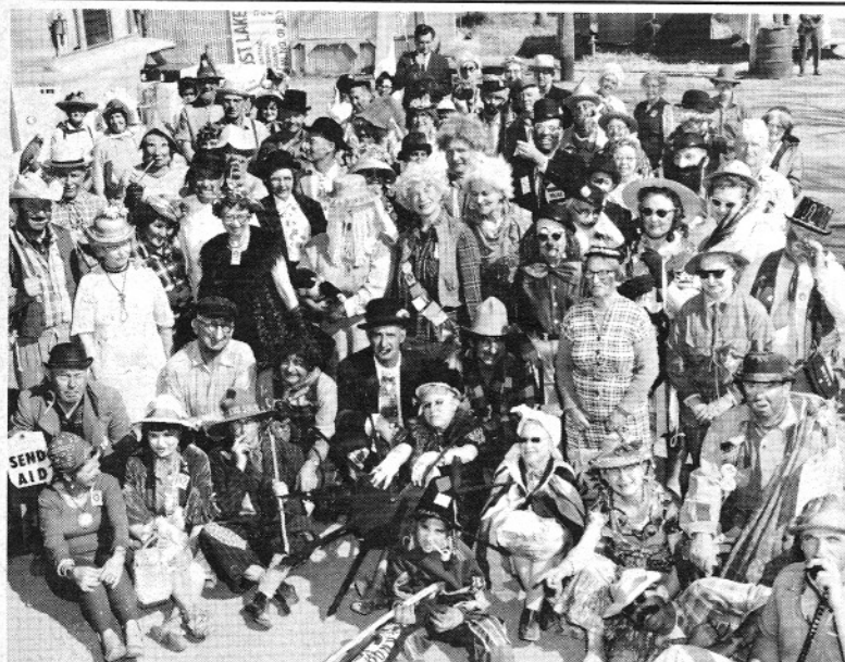
California Unit having fun at Hobo Rally