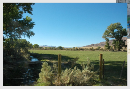
Looking west towards Ft Churchill