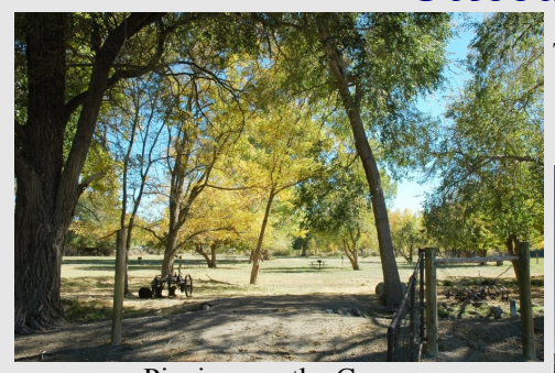
Picnic area, the Carson river is at the far end

The Rally site was across the road from the Historic Buckland Station. This area is not generally open to the public for camping