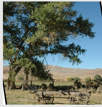
The old farm equipment was donated by a local museum