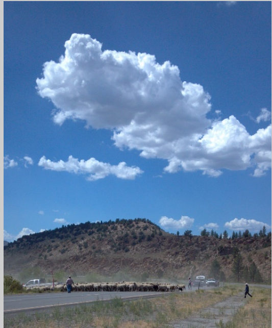
A flock of sheep crossing US 395 South of Mammoth