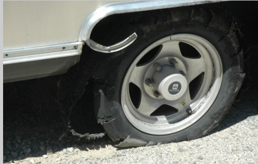
Jerry's shredded tire meant a stopover in Hawthorne