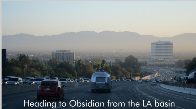
Heading to Obsidian from the LA basin