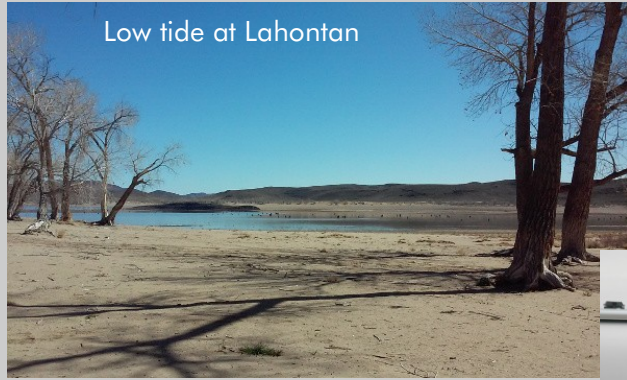
Low tide at Lahontan