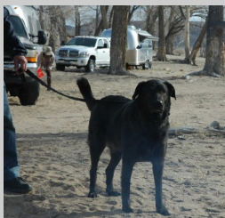
Scout all grown up