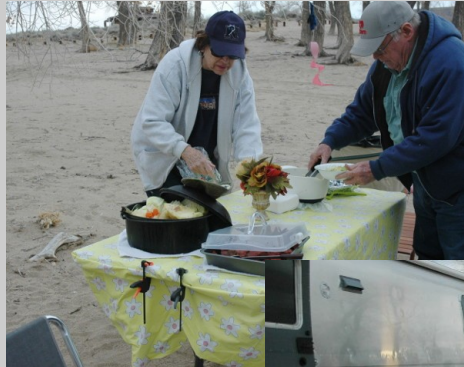
Corned Beef & Cabbage for dinner