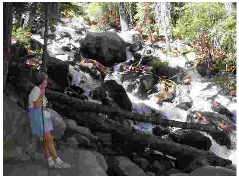
Falls above Twin Lakes - 30 Minute hike