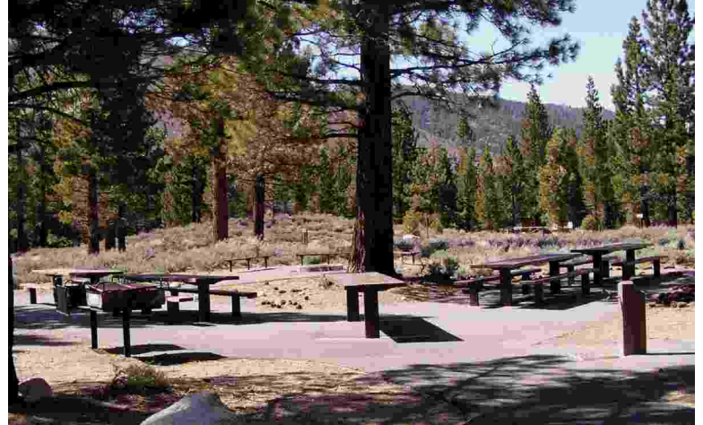
Picnic Tables and Group Campfire Area