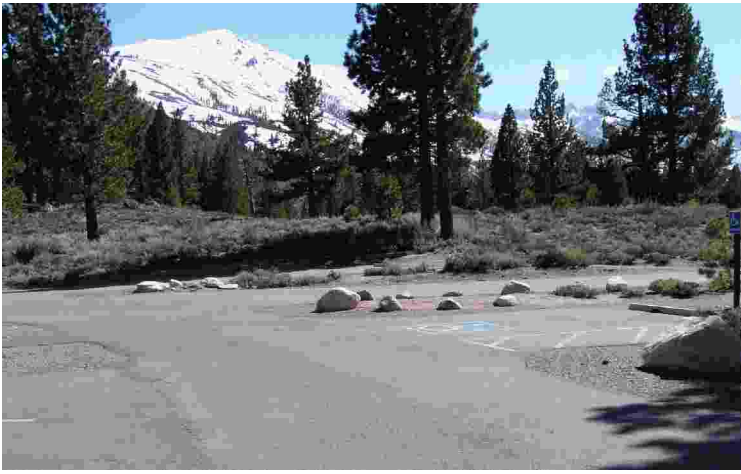
Group Campground - Crags Campground, Twin Lakes