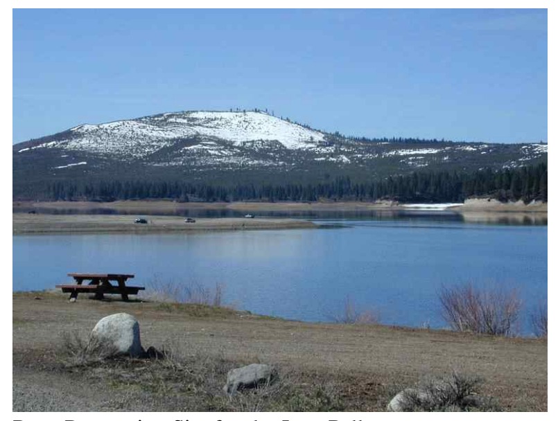
Boca Reservoir - Site for the June Rally

Boca Reservoir is Northwest of Reno about twenty miles. Take I80 west from Reno towards Truckee. Exit at the Hershdale exit and go over the bridge and up the road to the dam. About 1 mile from the freeway. Continue around the east side of the reservoir for about one half mile to the campground located on the left side of the road. See maps on back side.