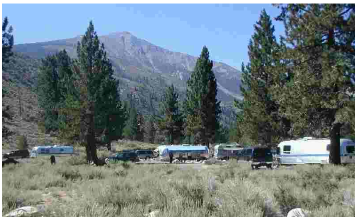
Twin Lakes Rally, August 2003