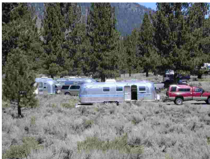
Group Campground at Twin Lakes