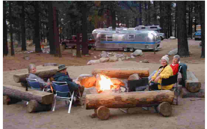
Davis Creek Rally, October 2003