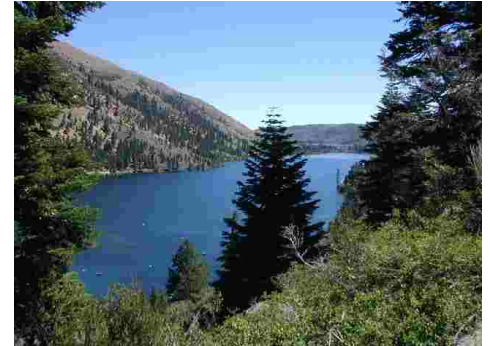
Twin Lakes - Near Bridgeport, CA