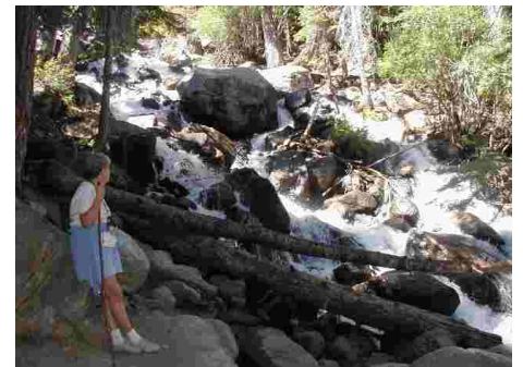
Falls above Twin Lakes - 30 Minute hike