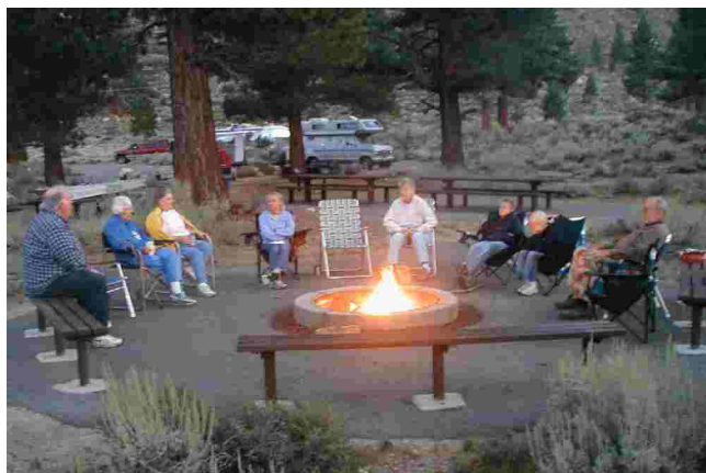
It doesn't get any better than this