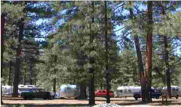
Boca Springs Rally, June 2004