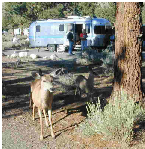
Even the deer enjoyed the rally

Let us know if you plan on joining us at the Rally - Please take a moment to complete the sign up sheet below and return it to: Sierra Nevada Unit, WBCCI PO Box 60572 Reno, NV 89506