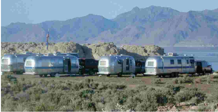
Pyramid Lake Rally, April 2004