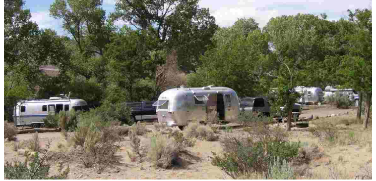
Dayton State Park Rally, May 2004