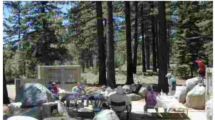
Spooner Lake Picnic, July 2004