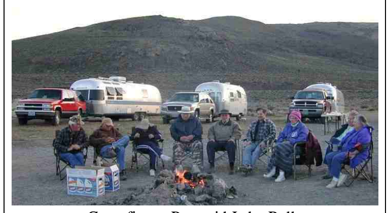
Campfire at Pyramid Lake Rally

http://sierranevadaairstreams.org Click on April 2004 rally.