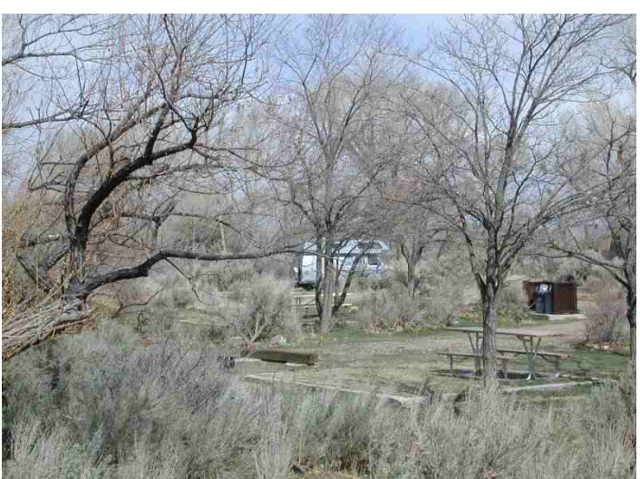
Campsite - Dayton State Park