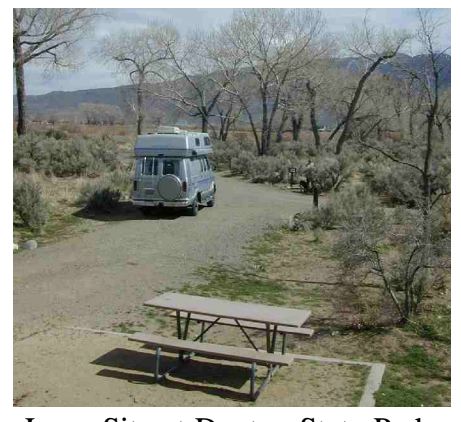
Long Site at Dayton State Park

Or are you counting on someone else to do these things?