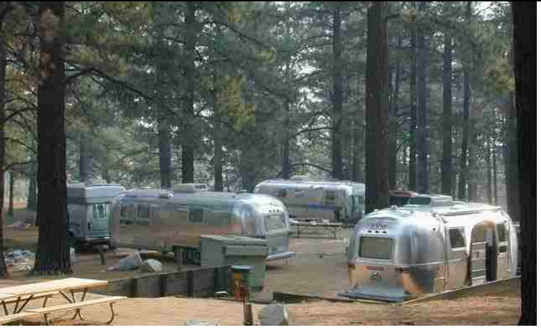
Davis Creek Rally - October 2004

2004 Accomplishments - We recently put together our list of accomplishments for 2004. The following are a few of the achievements of the SNU this past year.