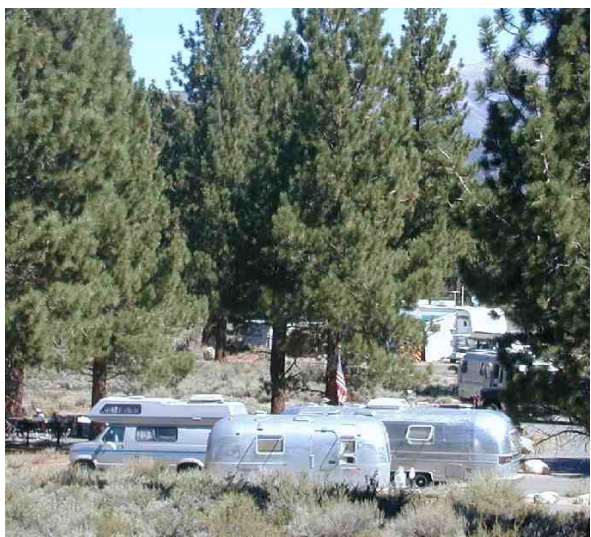
Twin Lakes Rally