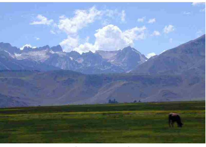
Mountains above Twin Lakes