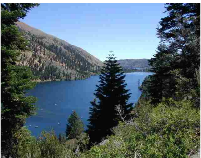
Twin Lakes - As seen from the trail to the Falls