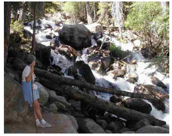
Falls above Twin Lakes - 30 Minute hike