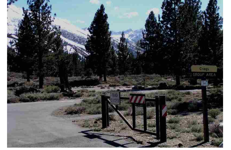
Crags Group Campground