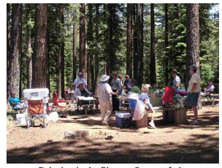
Relaxing in the Pines at Spooner Lake