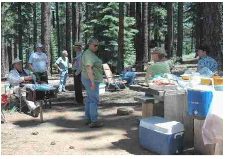
Chatting - an SNU tradition