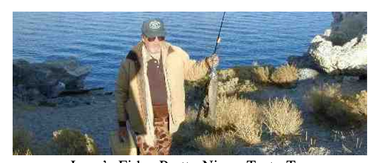
Jerry's Fish - Pretty Nice - Tasty Too