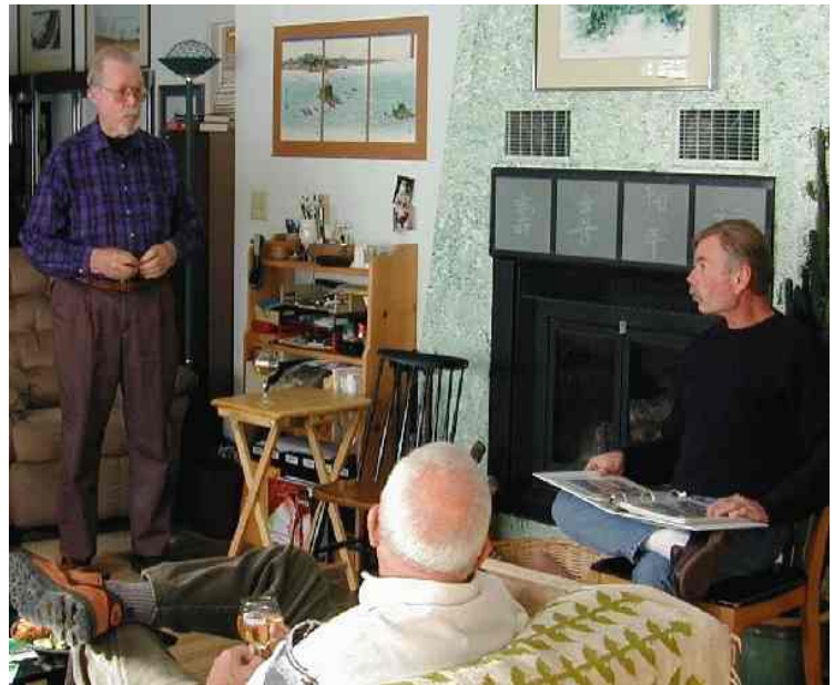
December Holiday Luncheon at Hersey's