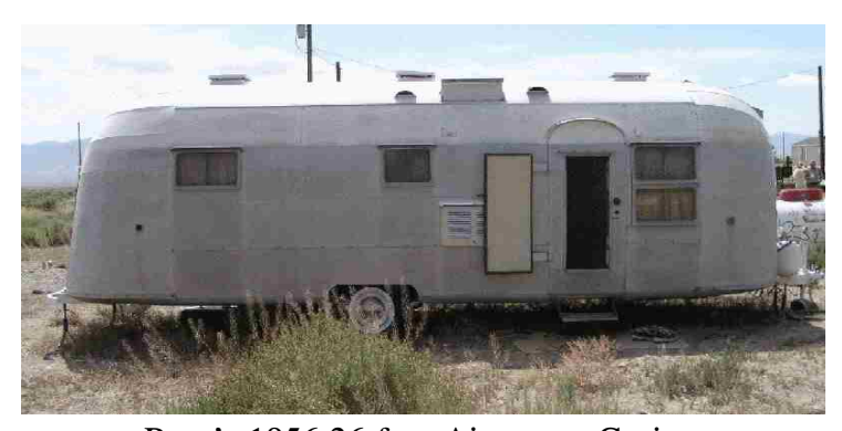
Root's 1956 26 foot Airstream Cruiser