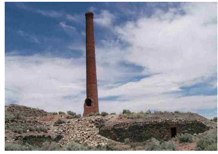
Belmont Mill at Belmont Ghostown