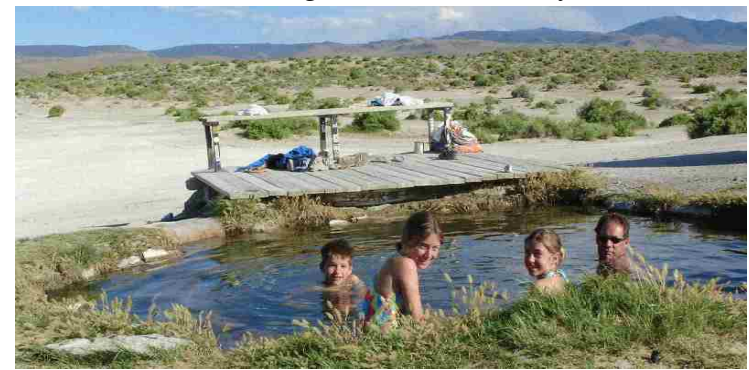
Root Family at Spencer Hot Springs near Rally