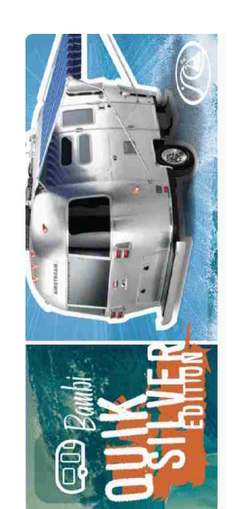
Edition Bambi the perfect way to make waves with a stylis statement on the road, at the beach or just about anywhere. Airstream has partnered with legendary surf brand Quiksilver to

Mountain Family RV, Nevada's only Airstream Dealer, announces that the exciting new 16 foot Quicksilver Edition Bambi will be coming to Reno soon. Plan to come by and see this outstanding new trailer. You will love the nautical decor and the new floorplan with a full width rear bed and front