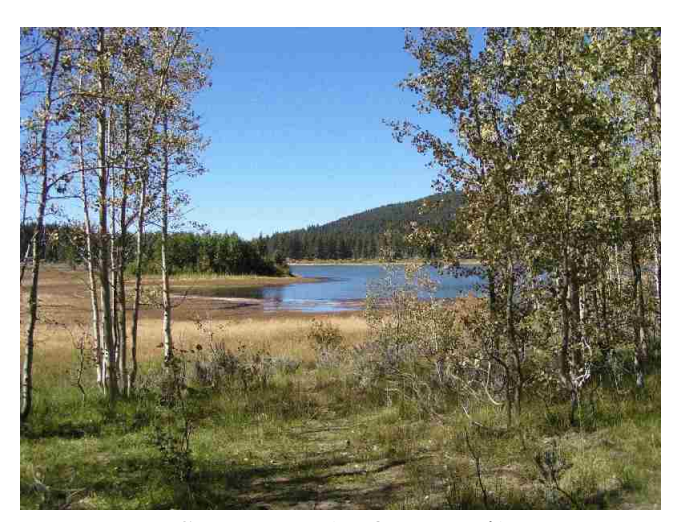
Spooner Lake from Trail