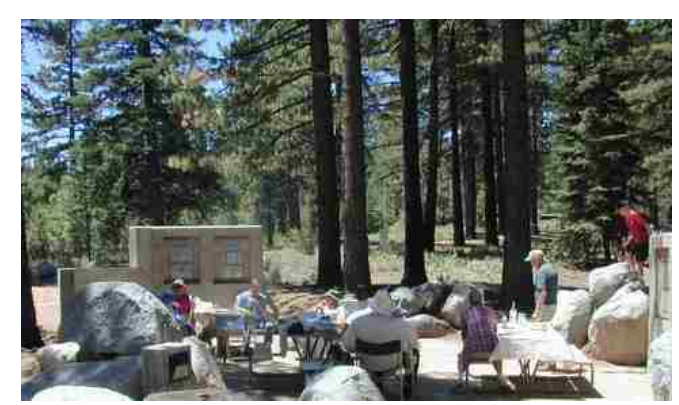
Spooner Lake Picnic, 2004