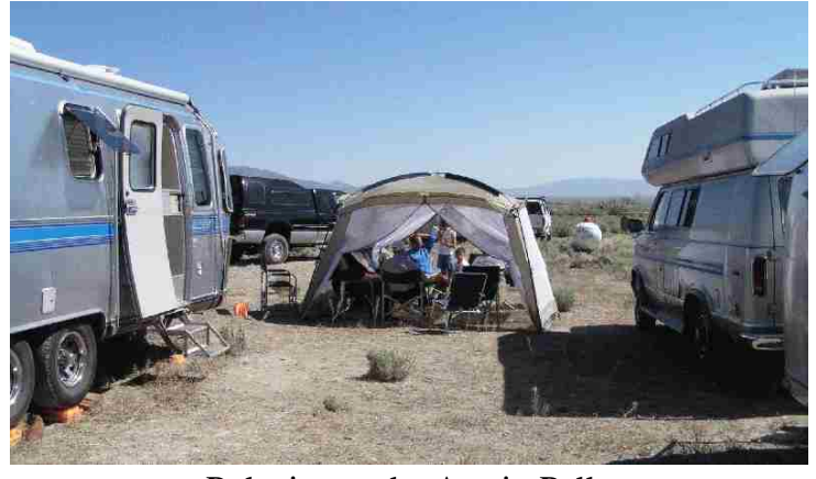
Relaxing at the Austin Rally