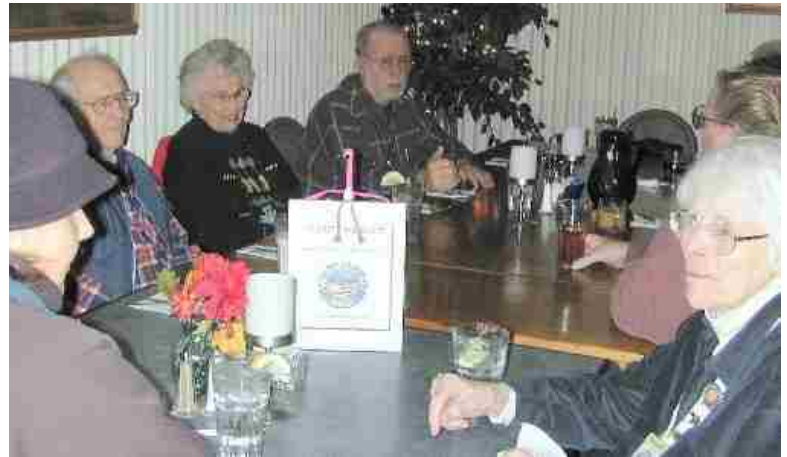
February Luncheon at Fallon