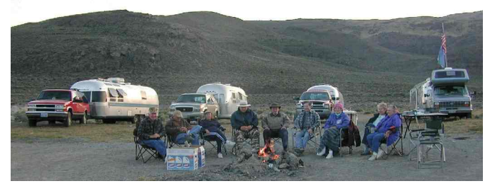
Campfire on the Lake