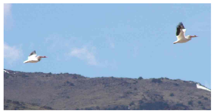
White Pelicans cruising by the camp