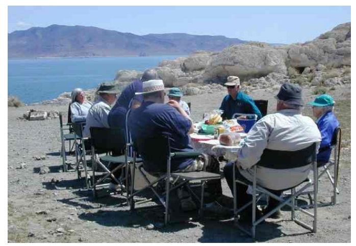
Lunch in the Sun