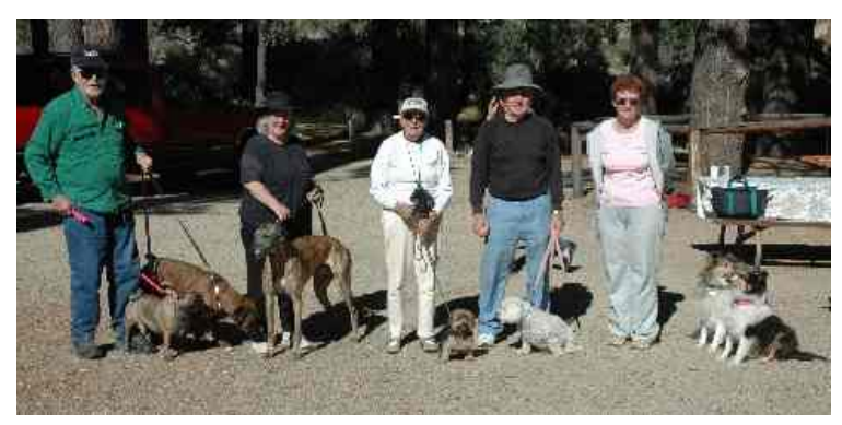
Is the SNU going to the dogs?