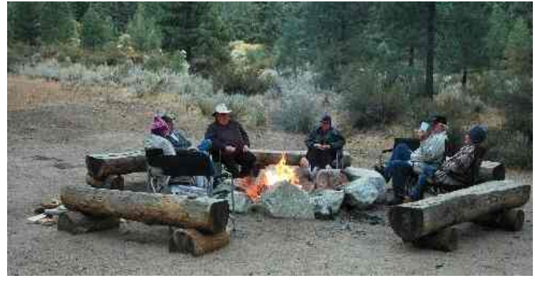
Folks, it doen't get any better than this