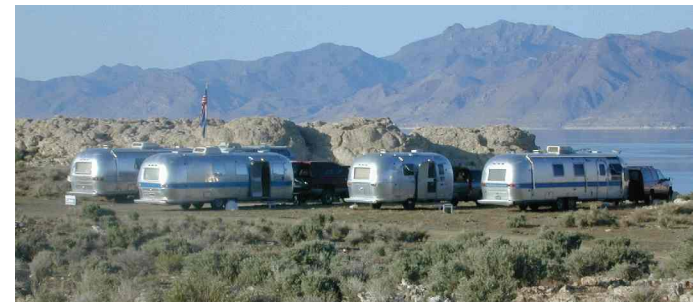
2004 Pyramid Lake Rally

November Rally Thursday - Sunday November 10 to November 13, 2005Three day Rally, members & guests welcome. Board meeting Saturday open to all. Watch the pelicans, visit the nearby fish hatchery or take a day trip to the Indian Museum in Nixon. Boating and fishing are favorite activities at Pyramid. The rally location is Northeast of Reno about fifty miles just north of Sutcliffe. From Reno/Sparks take the Pyramid Lake Highway route 445 North. From I80 east of Reno take route 447 towards Nixon and then route 446 to merge with route 445 going North. The preferred Camp spot is near the Pelican Point boat launch about 3 miles north of Sutcliffe. While route 445 is paved, the 'road' to the beach is gravel turning to hard packed sand for a short distance to the camping spot. Be sure to bring some firewood for our campfire. For more information check the website http://sierranevadaairstreams.org