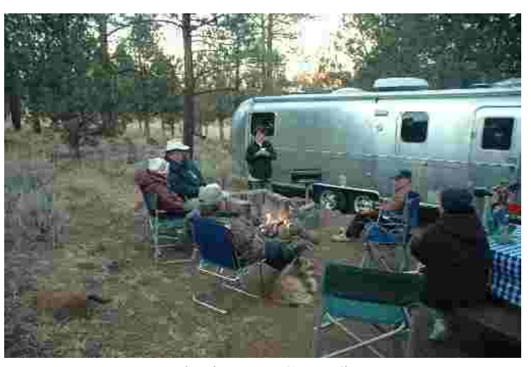
Enjoying the Campfire