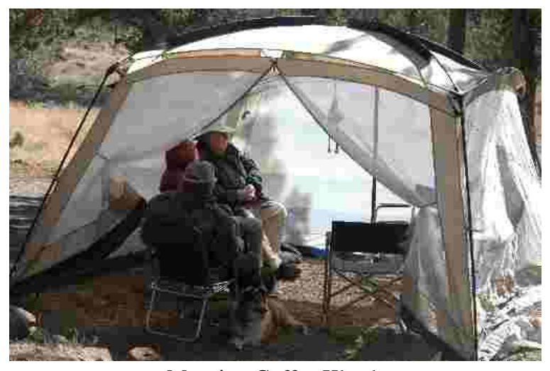
Morning Coffee Klatch