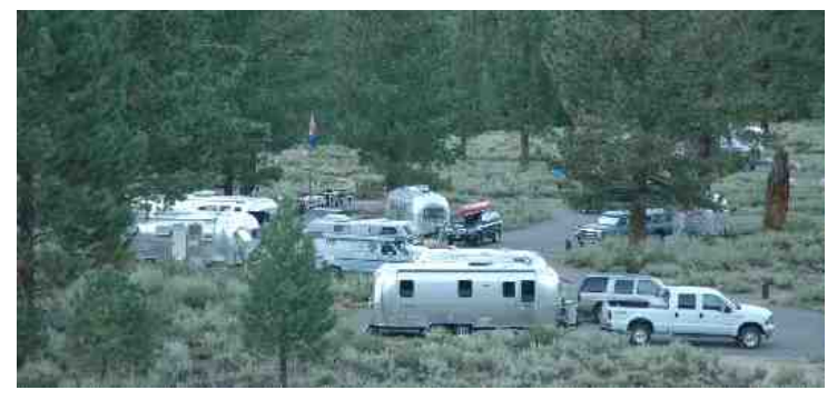
Airstreams at Twin Lakes

memories/rallies/05-06rallies.html If you have pictures of this rally or any other SNU gathering, please send copies to the Leipper's at 714 Terra Ct, Reno, 89506 or email hq@sierranevadaairstreams.org To make sure we have the whole picture of SNU events, we want to include everyone's pictures in the SNU archives and scrapbooks.