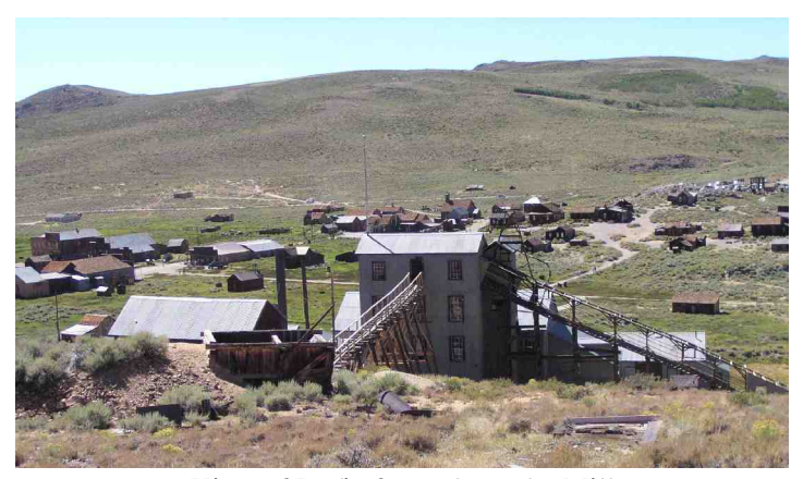
View of Bodie from above the Mill

September Rally The next SNU rally will be Thursday September 22 through Sunday September 25 at the BLM campground on the north end of Eagle Lake. The campground is about 30 miles northeast of Susanville, CA. Take Hwy 139 north of Susanville past Lassen Jr College. There is a long and somewhat steep grade out of Susanville but it should pose no problems for anyone. You will drive along the east shore of Eagle Lake before reaching the turn off. Turn left on A1 (Eagle Lake Rd.) The campground will be on your right just a short distance from Hwy 139. You can also follow Hwy 36 through Susanville and up a shorter grade to Eagle Lake rd. Turn right and follow this road around to the North Eagle Lake BLM campground. The campground is individual sites. I talked with BLM and there should be no problem having enough sites for every SNU member who attends. He also assured me that there were some sites appropriate for longer rigs. There is lots of good fishing, birding, hiking, and just plain enjoying the scenery at Eagle Lake so plan on joining us for the rally. see http://sierranevadaairstreams.org/snu/events/05sp-eaglelk-index.html