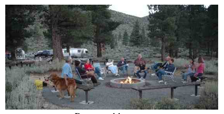
Dogs need love too