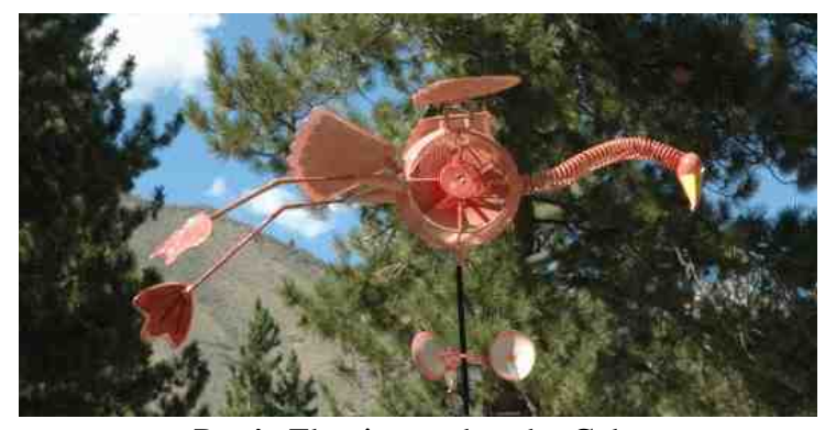
Roy's Flamingo takes the Cake