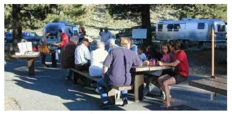
Happy Campers at Pot Luck