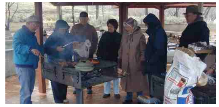
Cold, but it sure smells great