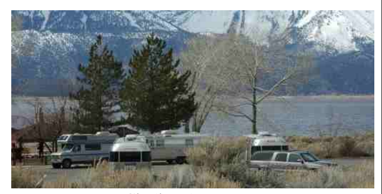
Circling the Wagons