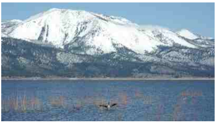
Canada Goose on Washoe Lake