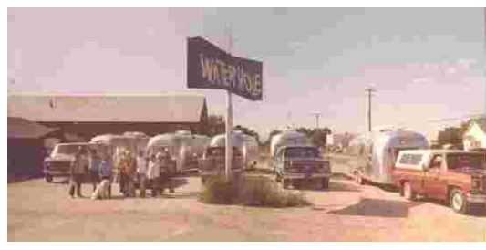
1980 SNU Mid Nevada Caravan ready to leave Fallon.