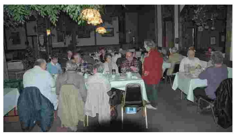
January SNU Luncheon at Bavarian World

We would like to hear from those of you who were not able to attend the meeting. You can print out the opinion form, fill it in and email, fax or mail it to the SNU. Fax number - 775 972 5011. Mail: PO Box 60572, Reno NV 89506. To see pictures of the luncheon go to: http://sierranevadaairstreams.org /memories/rallies/06jabavarianworld/gallery.html