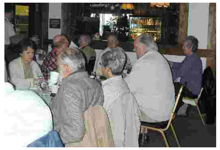
Happy Campers at Luncheon