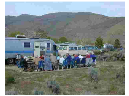
2000 Washoe Lake Rally