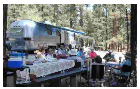
2002 Rally at Davis Creek