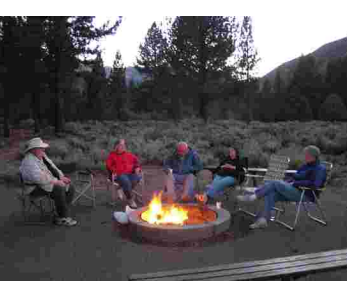
Twin Lakes in 2004