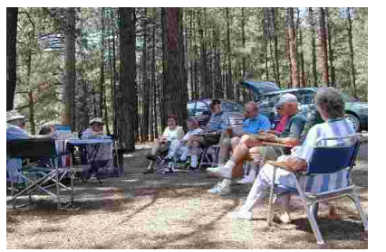
2002 Davis Creek Rally