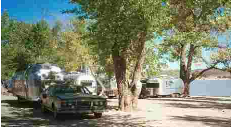
1996 SNU Lahontan Rally