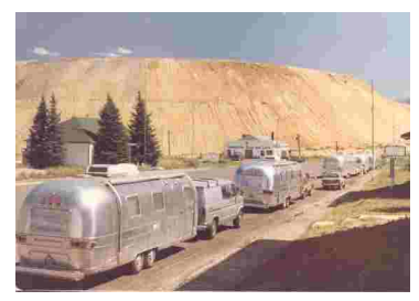
1980 Caravan at Kennecott