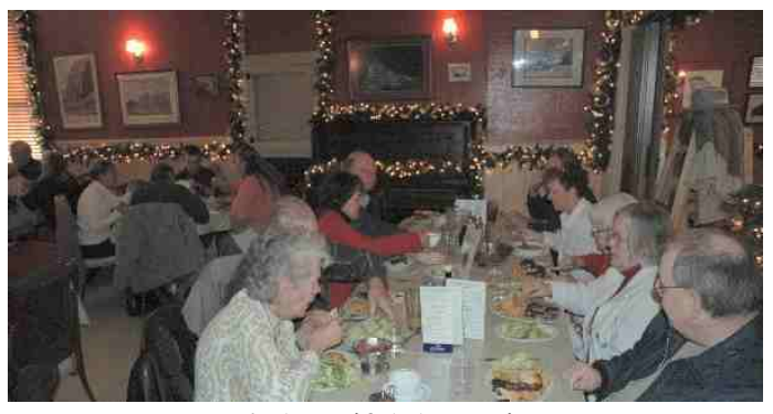
JT's beautiful decorations