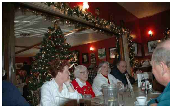
Christmas Tree, Christmas Friends