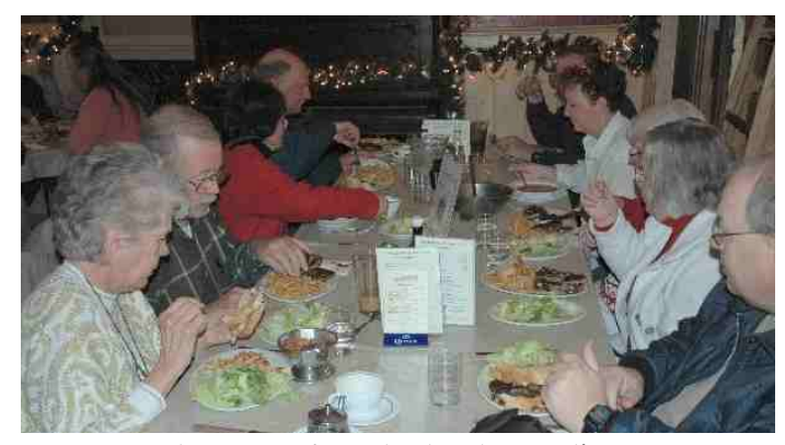
The Hersey's and other happy diners