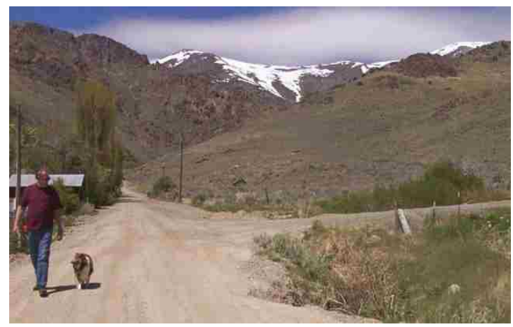
Stay left and make wide right turn