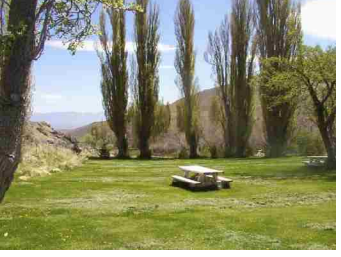
Picnic table area

May Rally at Unionville - Location: Off of I 80 East. About 60 miles East of Lovelock. Take exit 149 (about 44 miles from Lovelock) towards Mill City/Unionville, go 0.1 mile. Tum right onto NV-400, go south 16.6 miles. Turn west (right) onto the gravel road to Unionville, go 2.1 miles. (there is a green road sign telling you the turn is coming up). Go up the canyon (a very slight incline) 4.1 miles to the campsite (park). Note portions of this road, i.e. the section to Unionville is unpaved. It is good gravel, wide enough for Airstreams and no steep grades.