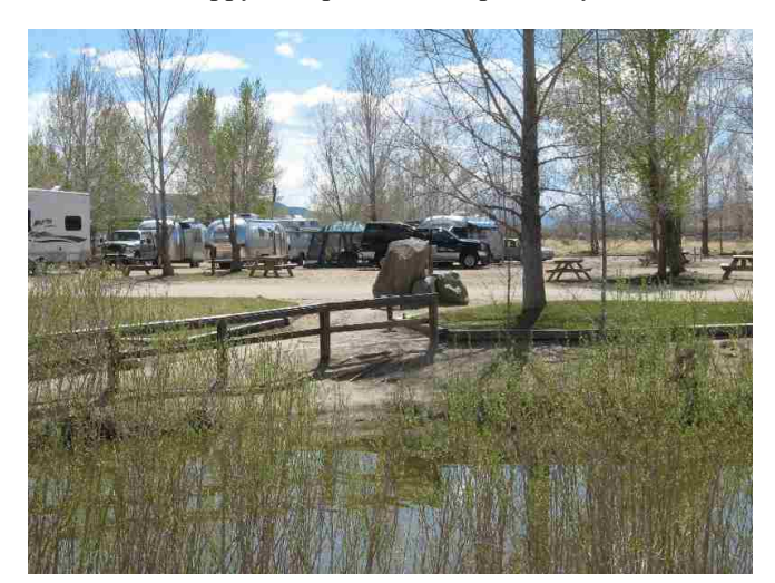
Pretty grounds at the Walker River Resort