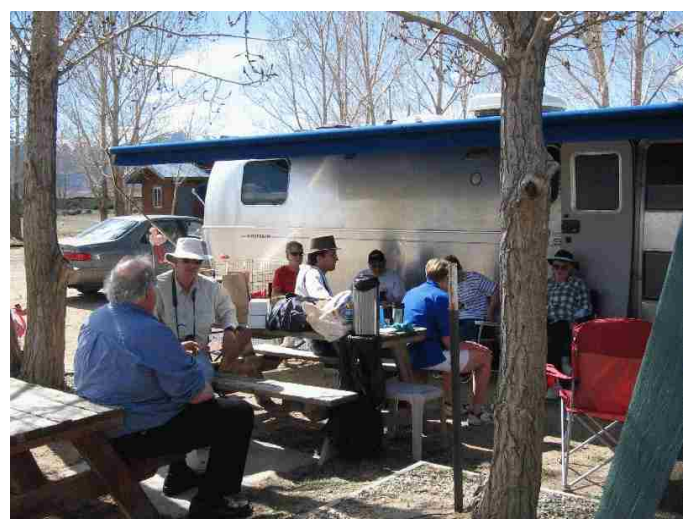
Happy Campers at the April Rally

It was then discussed if the unit should now, because of our increasing membership, consider electing a vice president for the unit. This position would assist the president, fill in at times the president was absent, and be a yearly elected office. It would not be a position that would immediately move to president the next year as it is with the WBCCI. It was discussed that maybe the directors be given some additional responsibilities. Of the three positions, one might be delegated to marketing and promoting the WBCCI and the Sierra Nevada Unit, one doing the rally schedule and locations for the following year, and the third doing the newsletter.