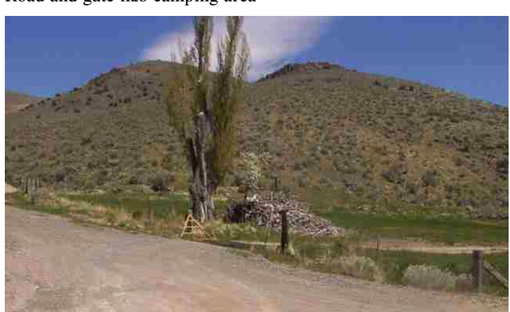
Gate into camping area