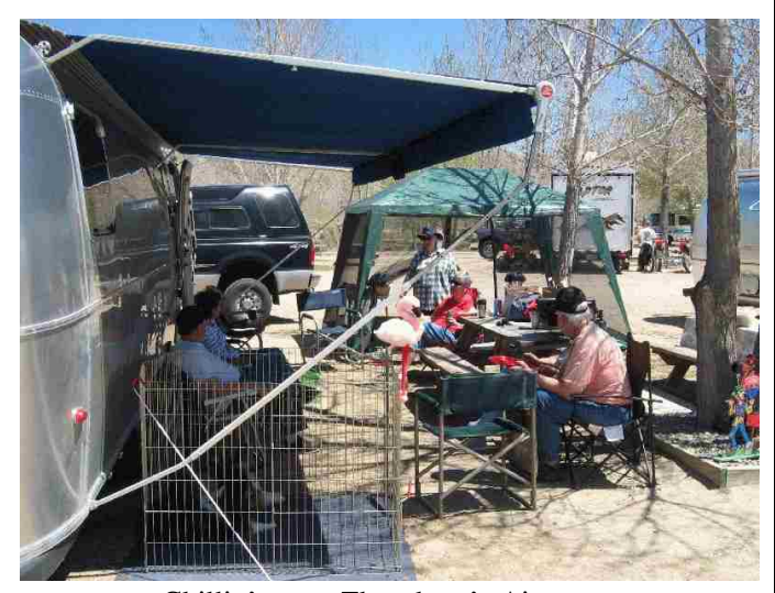
Chillin' out at Thornburg's Airstream