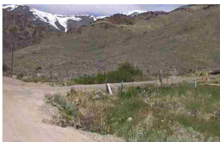
Road and gate into camping area