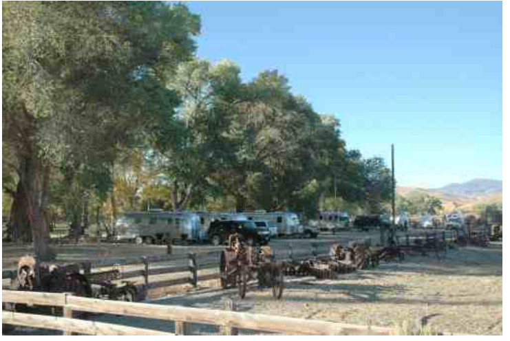
Ft Churchill Rally on the ranch

Other rally activities included our usual pot lucks, catching up on the Thornburgs and the Curtis's remodeling projects, sharing information and ideas, and of course just relaxing around the campfire. A good time was had by all and I think the general opinion is that we should keep this site on our list of potential rally sites in the future. Check out the rally photo galleries in S N U Z E , what some words on the websitehttp://www.sierranevadaairstreams.org/snuze/index.php?cat=14