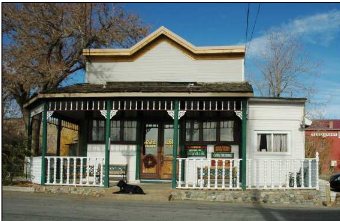
The Gold Canyon