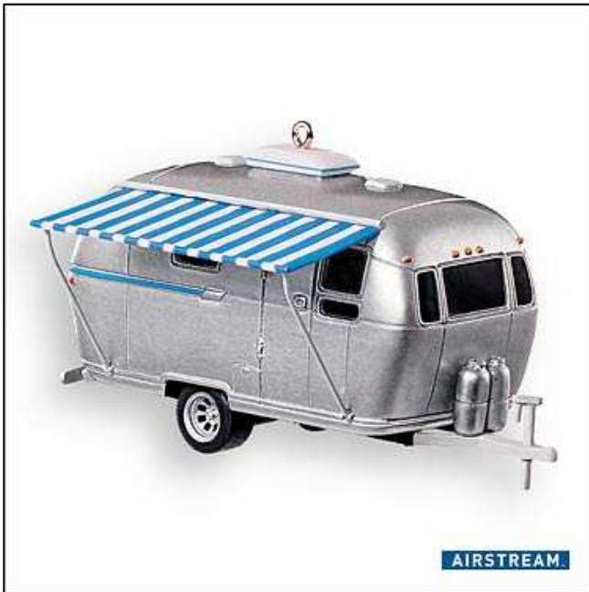
Hallmark's 2007 Airstream Christmas Ornament

Directions: From I-80, exit on East McCarran Blvd and go south to Rock/Pembroke Blvd. or from South Virginia go east on McCarran Blvd to Rock/Pembroke Blvd. Go east on Pembroke towards the hills to the stop sign at Tamarisk St., turn right on Tamarisk. Turn left on the 4th street which is Sleepy Hollow Dr. Go up the hill and around the bend to 4610 Sleepy Hollow Drive .