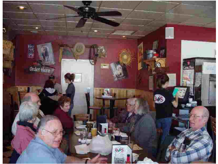
Happy Campers at BJ's