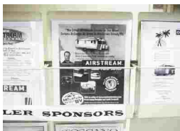
Mt Family flyer at WBCCI HQ

I have never made a road trip of this distance before because I always flew my airplane when traveling any distance in the U.S. What really impressed me on this trip is how slow road travel is. Even a slow airplane is many times faster than a road vehicle. It seemed as though I would drive and drive and drive and still not get anywhere.