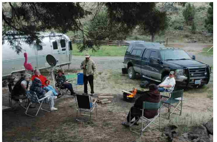
And of course, the campfire. Good folks, Good times