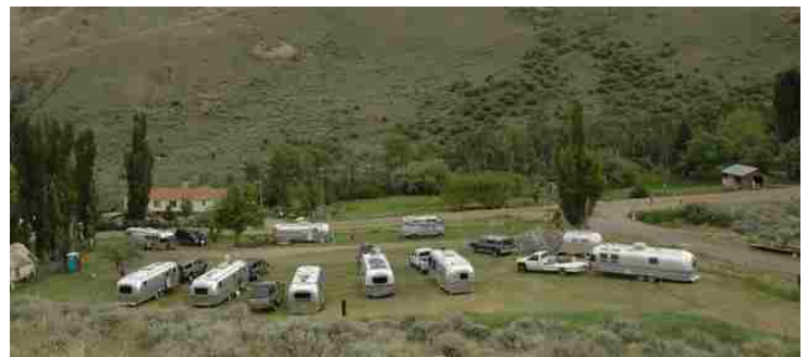
Bunch of Airstreams, 16 foot to 31 foot