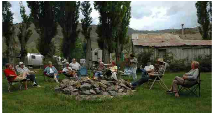
Unionville Campfire, they look relaxed