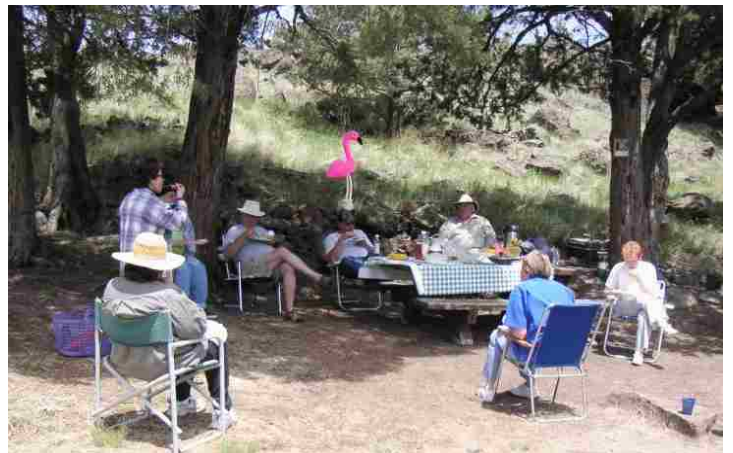
Lunch, what we do best