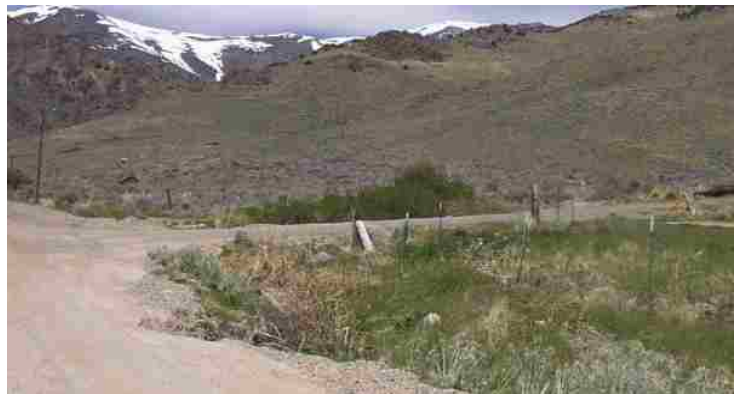
Road and gate into campground