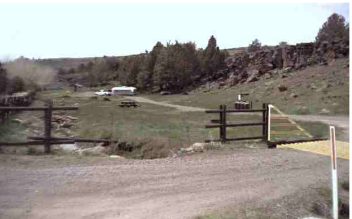
Entrance to the campground from Rd 26000