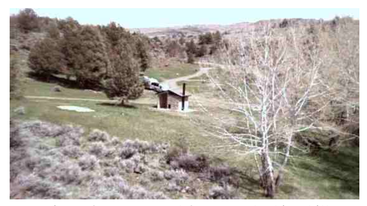
View of campground from overlooking hill