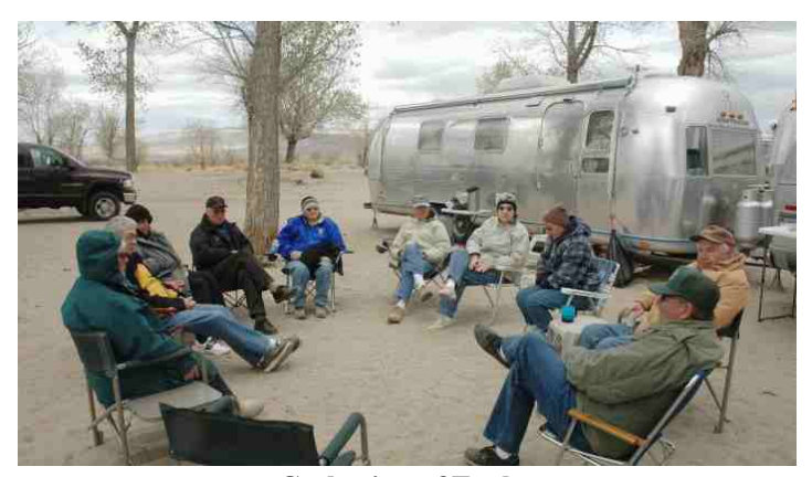
Gathering of Eagles