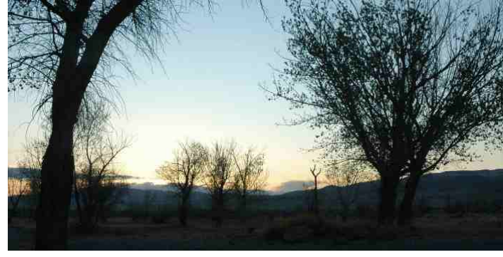
Day is done, gone the sun, All is well, safely rest, God is nigh.