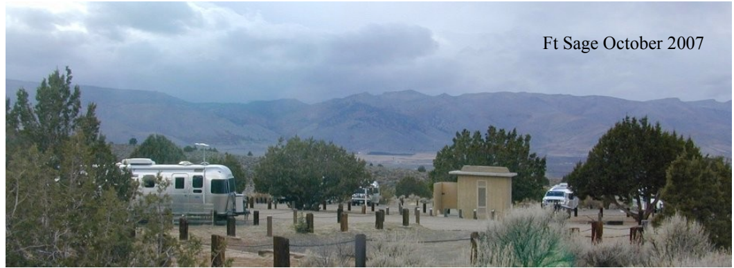
Ft Sage October 2007

For information discussed in this newsletter including the April Rally at Pyramid Lake, please Click Here