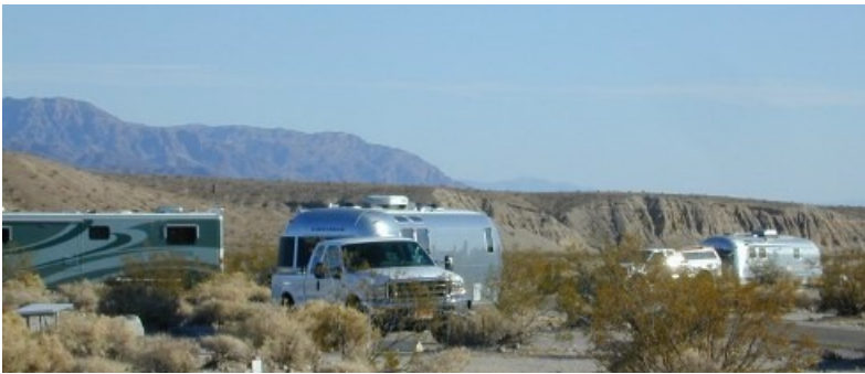
2009 SNU at Death Valley

The SNU will hold it's southern most AND LAST rally of 2010 at Mesquite Campground in the Northern part of Death Valley November November 18 – Sunday 21. We'd like to have a good idea of who plans to attend this rally so if it is on your schedule, please let the SNU know by emailing hq@sierranevadaairstreams.org . November is a great time to visit Death Valley. There is a lot to see and do, some things such as touring Scotties Castle are near the campground. Other things such as a visit to Furnace Creek and the Artists Pallet are a short drive from the campground.