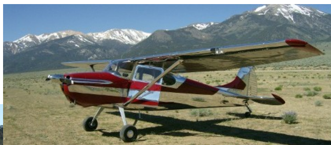
Vintage 1954 Cessna 170B at Sweetwater