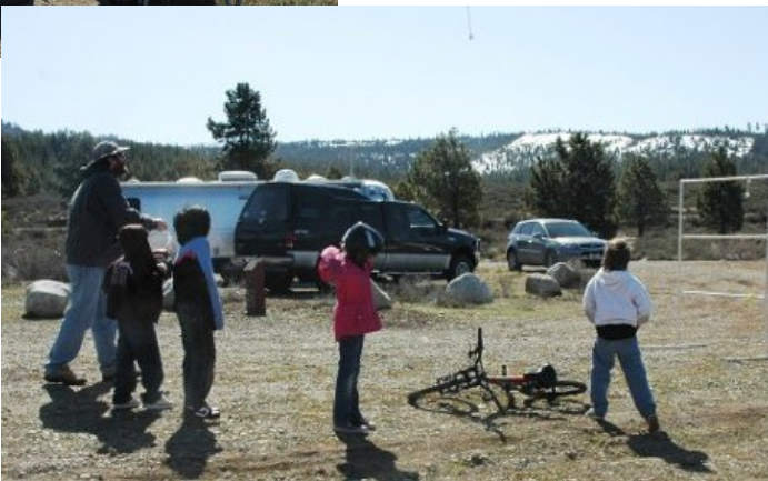
Kids learning a new game