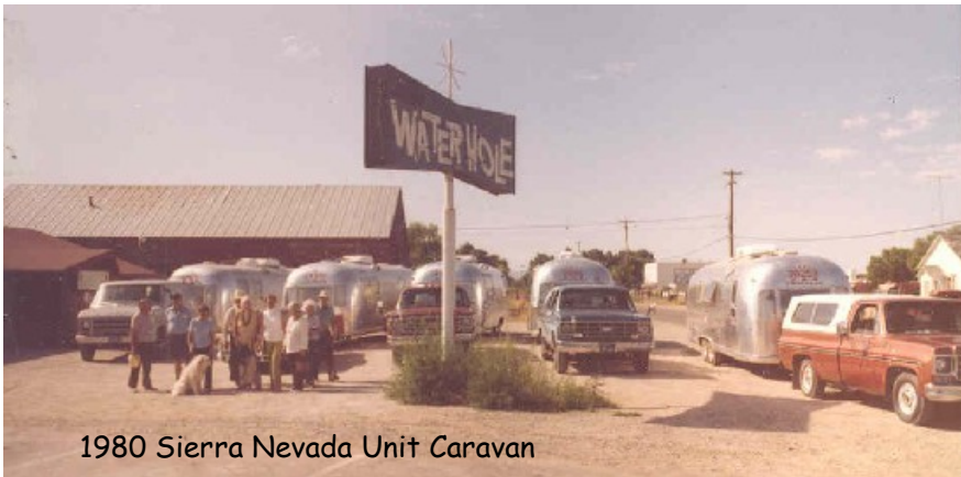
1980 Sierra Nevada Unit Caravan

The SNU website is more than a place to find current information, it is a repository of information, documents, photos, and other memorabilia of the SNU. The intention is to minimize or eliminate the need to keep paper and hard copy materials that require storage and that need to be passed on to current officers or members. It is meant to minimize the potential loss of materials that are part of the SNU history. Including this material on a website also enables all SNU members access to