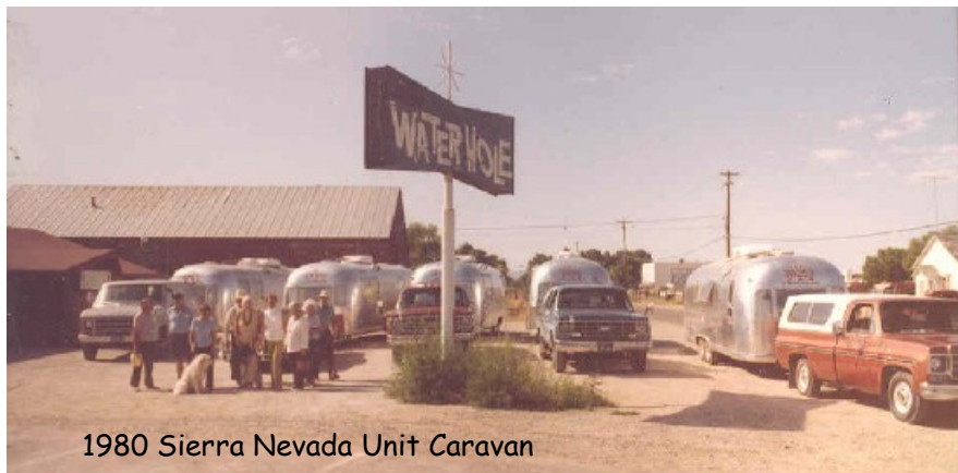
1980 Sierra Nevada Unit Caravan

The SNU website is more than a place to find current information, it is a repository of information, documents, photos, and other memorabilia of the SNU. The intention is to minimize or eliminate the need to keep paper and hard copy materials that require storage and that need to be passed on to current officers or members. It is meant to minimize the potential loss of materials that are part of the SNU history. Including this material on a website also enables all SNU members access to