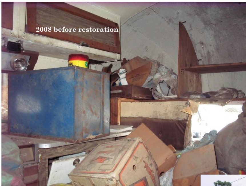
2008 before restoration