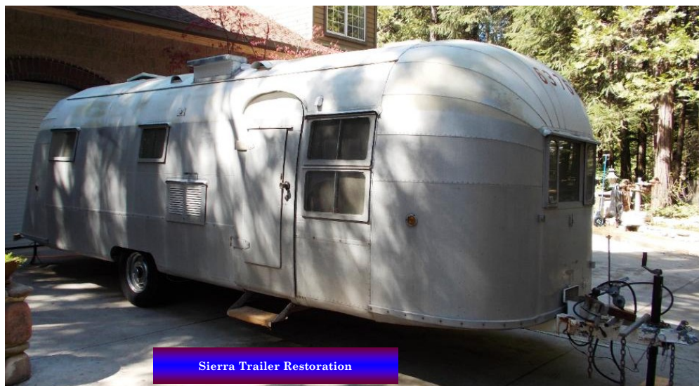
Sierra Trailer Restoration

plumbing and other systems will be fully upgraded and the exterior completely redone.