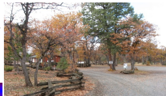
Park entrance and office

to BBQ. Saturday we plan on a brunch with Randy's special waffles. If someone has a back up waffle iron they could bring, that would be a big help. Rally participants could also bring some berries or melons for the brunch. Happy hours and other activities will depend on the whims and motivations of the rally participants. We haven't planned any specific tours for this rally but there are all sorts of possibilities. There are lots of nearby places for sightseeing. The park has some nice hiking trails. The park has a large enclosed picnic building that will be a good backup for meals and other activities. This will be a pretty special rally in a scenic part of Northeastern CA. We hope you have rsvp'd so you can join us at the rally and also provide your input about considering Lassen RV Resort for future SNU rallies. Randy plans on bringing the SNU diorama he and Vicki created in 2006 for the 30th Anniversary of the SNU. If you haven't seen this amazing creation, come to Lassen and check it out.