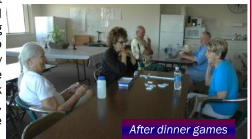
After dinner games