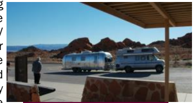
Visitors Ctr. Valley of Fire