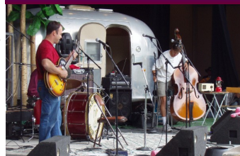
Pre-concert practice session