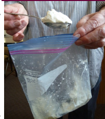
Ice Cream in a bag