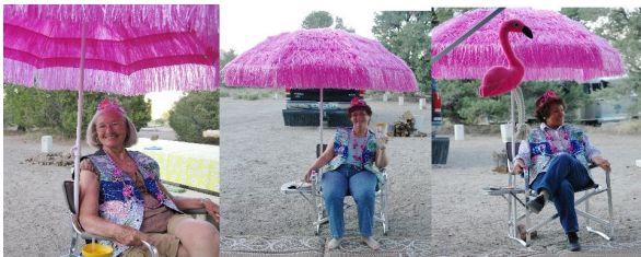
2011 Hickison Flamingo regalia