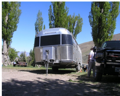
2008 Jerry's leveling at Unionville