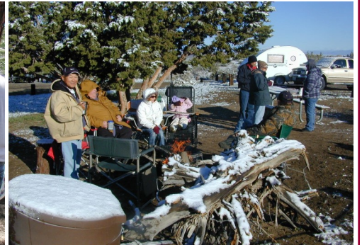
2008 Snowy morning @ Fort Sage