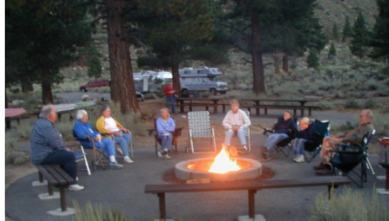
2003 Twin Lakes

There are so many great photos from SNU rallies, luncheons and other activities. Pictures that have been contributed from many SNU members and friends provide a wealth of memories and present a fairly extensive pictorial story of the SNU. You can find them in various places on the website including Rallies, Travelogues, Show-and-Tell, Destinations, and the Family Side of RV'ing. Here are just a few examples.