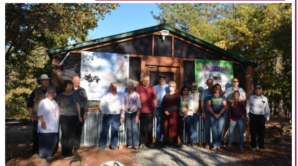
2017 SNU 40th Anniversary at Lassen RV Resort