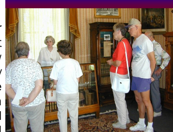
July 2000 Touring Bowers Mansion

It's the second month of a new year. It's a new decade for the SNU. We have several new members. It's a perfect time to incorporate some new ideas and create some new traditions. One new idea is the location for our February luncheon. There are a few other ideas percolating on the back burner for this year. Our first rally for 2017 in March is fast approaching. Are there some activities you would like to see at rallies? Are there some new things you would like to do, new places you would like to go? The SNU has done all sorts of things, both big and small over the last ten years including yoyo contests, horseshoes, kite flying, visiting museums, touring Bodie as well as other ghost towns and historic sites, brunch at a bed & breakfast, our own special brunches, helping out at the Silver Springs Fly-In, cast iron cooking, a dinner cruise on the M. S. Dixie, Nevada surf & turf BBQ's, enjoying the Cantaloupe Festival, ice cream socials, star gazing, and of course, pink flamingos and solar lights. Check the list of some of the SNU special activities on the website. A lot of our favorite activities and best memories have come from brainstorming crazy ideas and from spur of the moment inspirations. Put your own special mark on the SNU. All you need to do is share your ideas with the SNU and then help make them a reality.