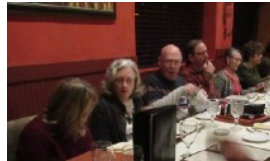
MARIO'S PORTOFINO RISTORANTE FOR THE HOLIDAYS