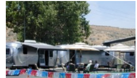
SNU HISTORY MOUNTAIN FAMILY RV