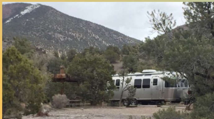
June Berlin-Ichthyosuar Rally - HOPEFULLY