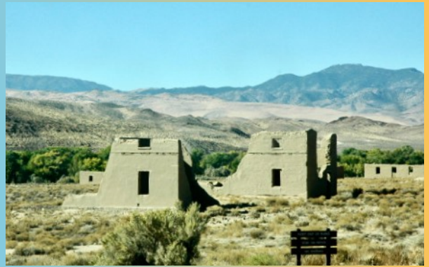
Fort Churchill State Historic Park

Last November the Blue Beret featured an article about an updated Caravan for 2020 to see the "Northern Lights and Polar Bears". If you are interested, we encourage you to inquire about the Caravan which was so memorable and fun for us. The new leaders are from Canada and have chosen to improve the route which will now start in