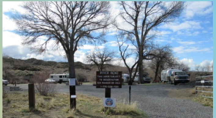
May Rye Patch Rally - MAYBE