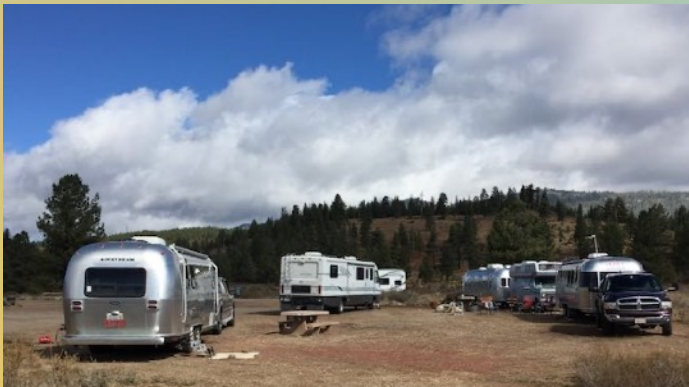
April Boca Rest Rally - CANCELLED