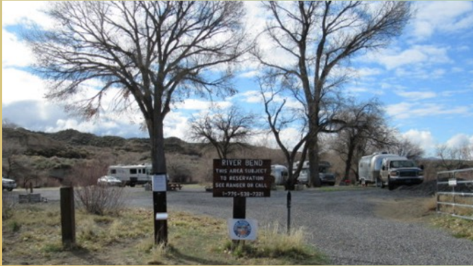
May Rye Patch Rally - MAYBE