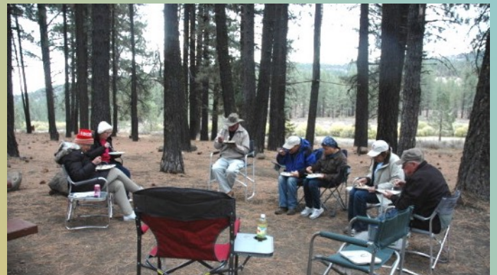
August Crocker-Beckworth Rally