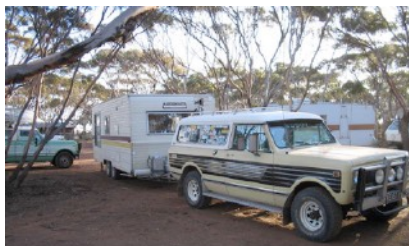
Friends in Australia