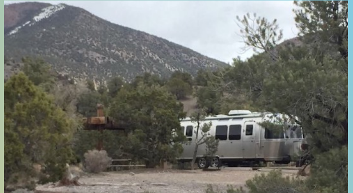
June Berlin-Ichthyosaur Rally - Hopefully