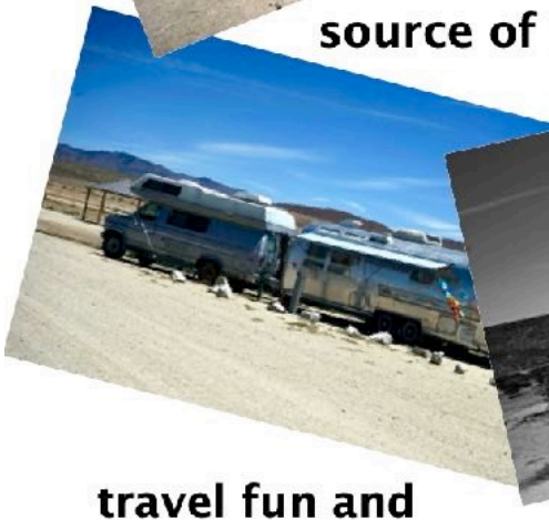
travel fun and