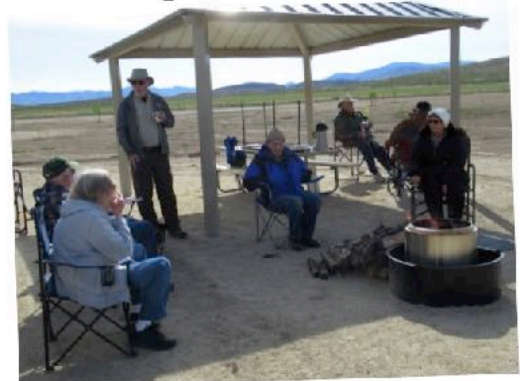
that provide an endless