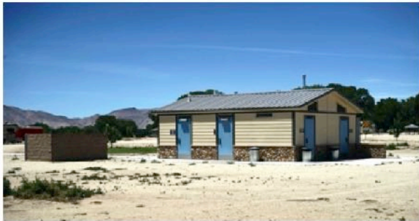
To encourage clubs and rallies