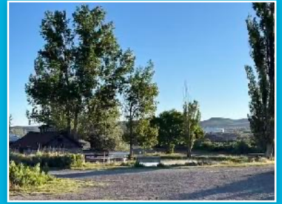
Sheldon Wildlife Rally Virgin Valley Campground west of Denio, NV June 16 - 19

https://blog.airstreamclub.org/making-connections-that-count-aci-shines-at-the-florida-rv-supershow/ .