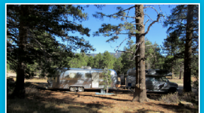
Hope Valley Dispersed Area, Markleeville, CA September 15th - 18th