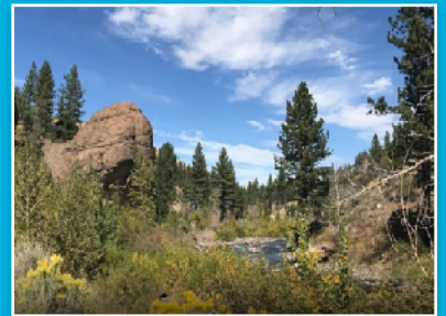
Markleeville Rally Centerville Flat Dispersed Campground July 14th - 17th