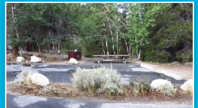
Lower Twin Lakes Rally Bridgeport, CA August 23rd - 28th