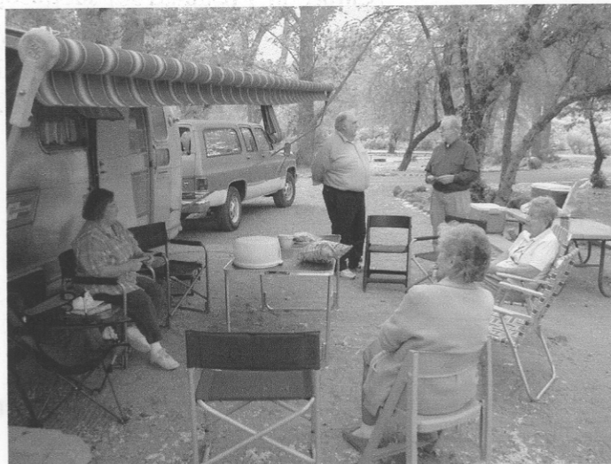
"Airstreamers" May '02 Rally