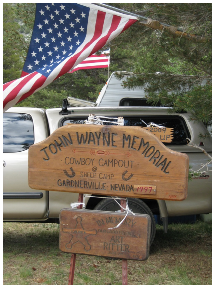
Placard for the campers that were there.