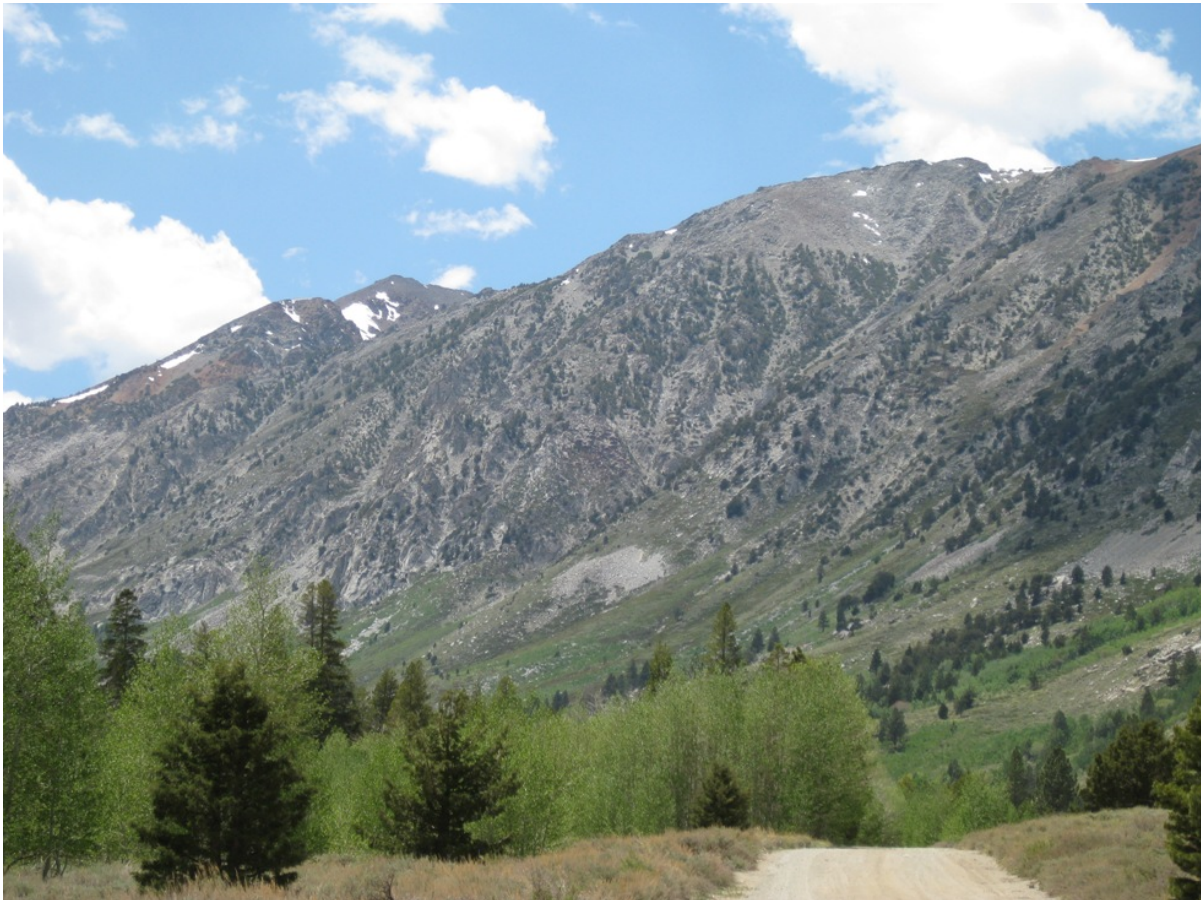
View up valley from this site.