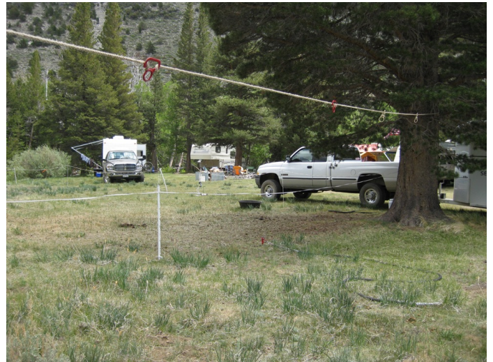
Campers at this site.