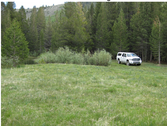
Trees at the eastern end. Creek on the left.