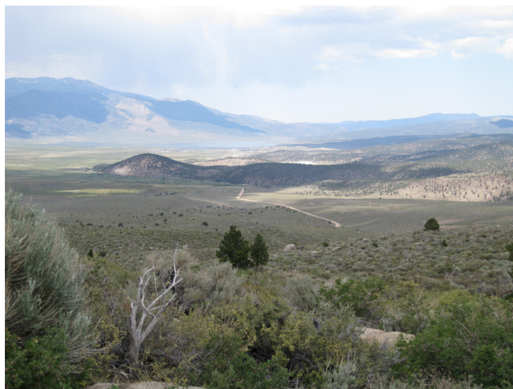
View of Bridgeport to the north when returning on Green Creek Rd.