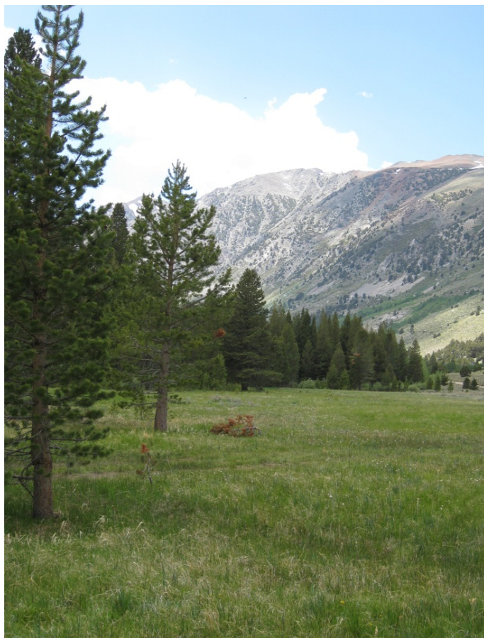
View up the valley from the meadow