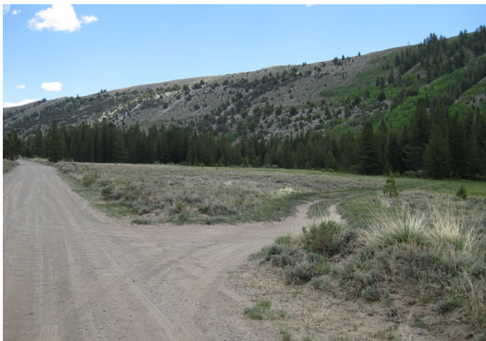
Entrance on the western edge.