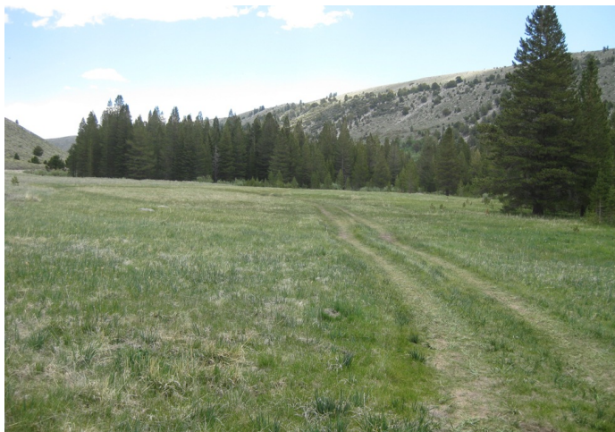
View of the meadow