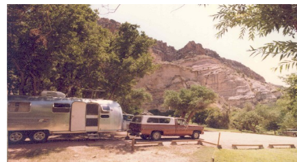
Camp at Kershaw-Ryan State Park