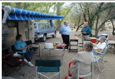
2002 Ft. Churchill