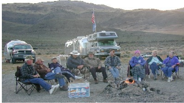
April 2004 Pyramid Lake

PO Box 60572, Reno, NV 89506 Phone: 775 972 5011