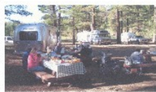
Baking in front of Mt. Family RV 2005 Silver