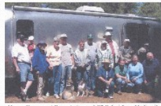
Happy Campers at Boca, in front of 28' Silver from Mt. Family

Upcoming Events: Saturday, July 16 - Boca Springs Summit State Park of Hwy 10 near South Lake Tahoe. The day: Aug 25 - Sunday Aug 28, Rally at Twin Lakes, south on US 395 near Shingler, CA. This rally includes a special day trip to the three towns of Boca. Thursday, Sep 22 - Sunday, Sep 25 - 2005 Eagle Lake RV Campground at the North end - about 10 miles southeast of Reno, CA off Hwy 150. More details on these and other events are on the web and will be included in future newsletters.