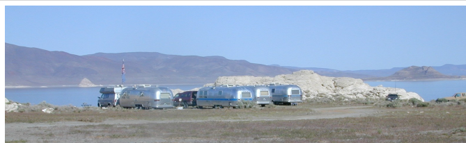
2004 Pyramid Lake