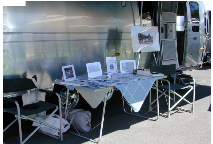
Display at the Royal Kick Off at the new Airstream Dealer Mountain Family RV