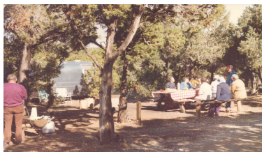
Camp at Ward Charcoal Ovens