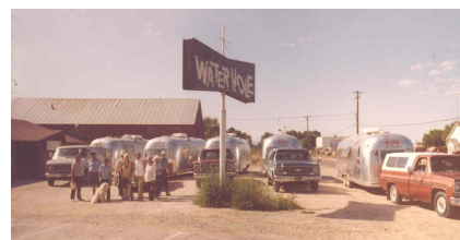
Getting ready to leave Fallon on Caravan