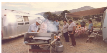
Breakfast at Scott's Summit