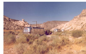
A26 towards Tonopah