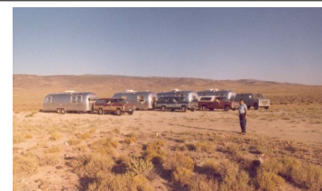
Camp Claustrophobia near Tonopah