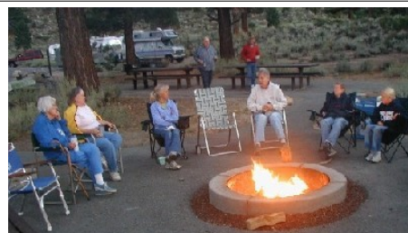
2003 Twin Lakes