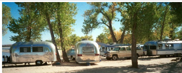
1999 Lake Lahonton