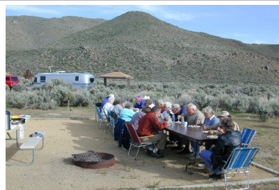
2000 Washoe Lake State Park