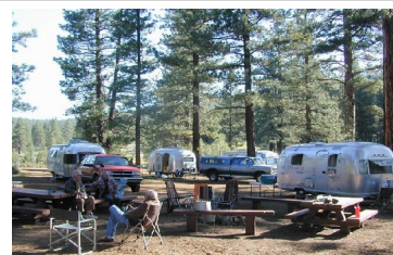
2004 Boca Springs