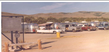
Camp at Scott's Summit