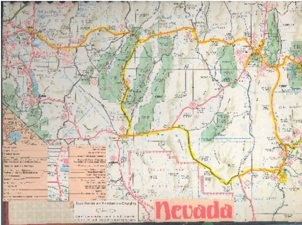
Route of 1980 SNU Caravan