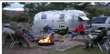
2004 Dayton State Park