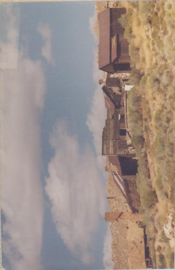
Old deserted shacks on top the tailings. What stories they could tell?? It is sad the mine is clo