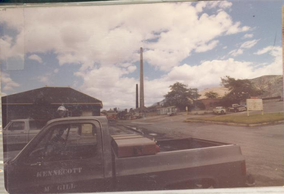
Above, the smelter at McGill, but we could not get permission for a tour. It runs at say half speed on imported slag from Utah, Colo. etc. Below, approaching Kennecott's huge Ely digs. Bottom, permission is granted for us to see the pit at top of the copper mine tailings.